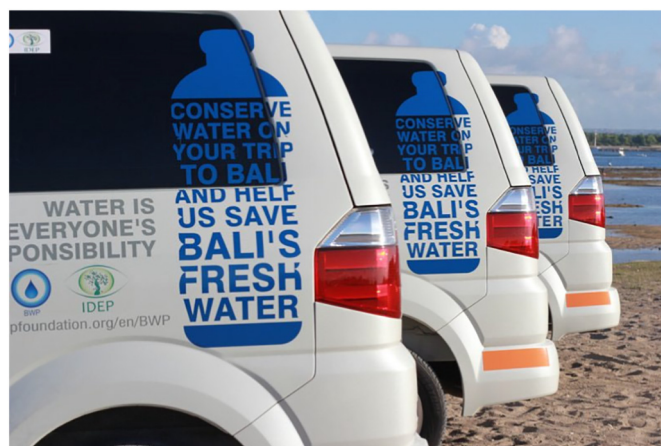
Fig. 2. Mobile campaign.