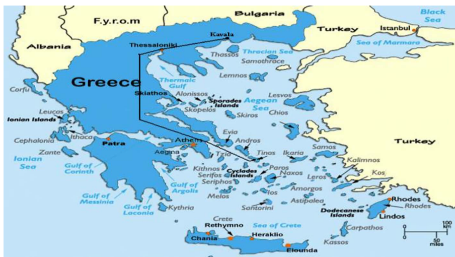
Fig. 1. Trips' route.

Thematic analysis was used to discern themes and aggregate dimensions (Boyatzis, 1998) through the examination and