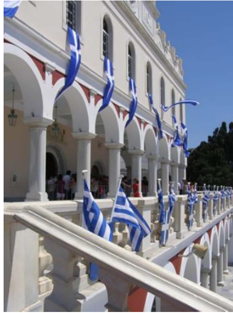
Fig. 3. Church of the Annunciation, Tinos,

“First and foremost it is curiosity that attracts you, because you watch it also on television... you see how they crawl... on their knees... and you want to be there that day when the masses ascend to the church to see what exactly is happening... I was impressed when I saw a famous singer on TV crawling to the church... You see, all that influences you...”