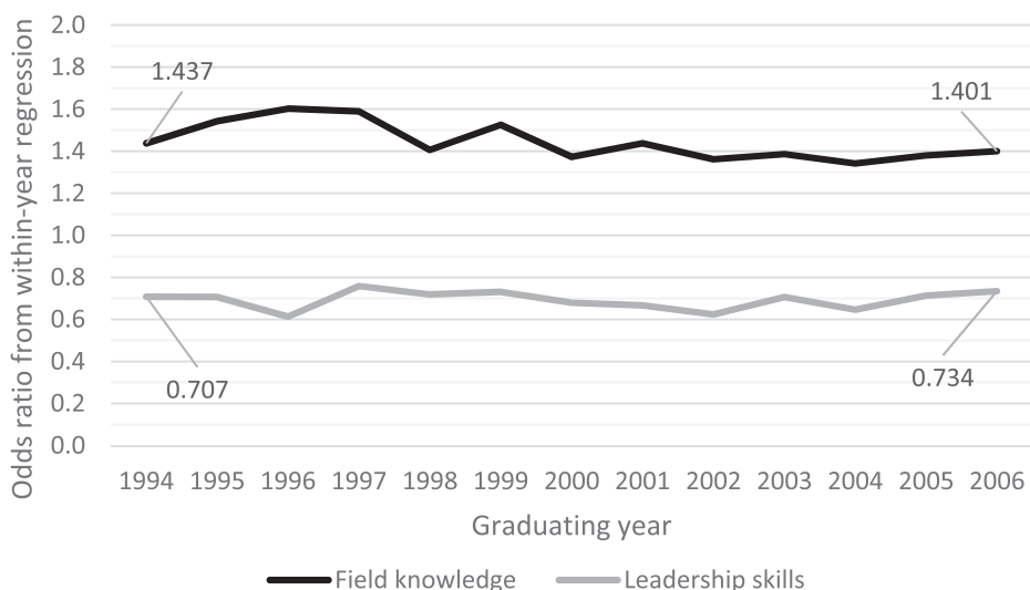
Fig. A2. Examples of change in accounting education impact. Notes: Graphed here are example time plots of odds ratios from the fixed effect ordered logistic regressions run within each sample year. Field knowledge and leadership skills are the categories estimated to be the most positively and negatively affected by accounting education, respectively.