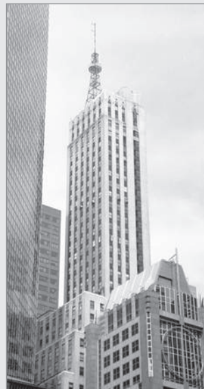
Figure 1.1 The New York Headquarters of the Fourth Network

150 EAST 34TH STREET, NEW YORK.