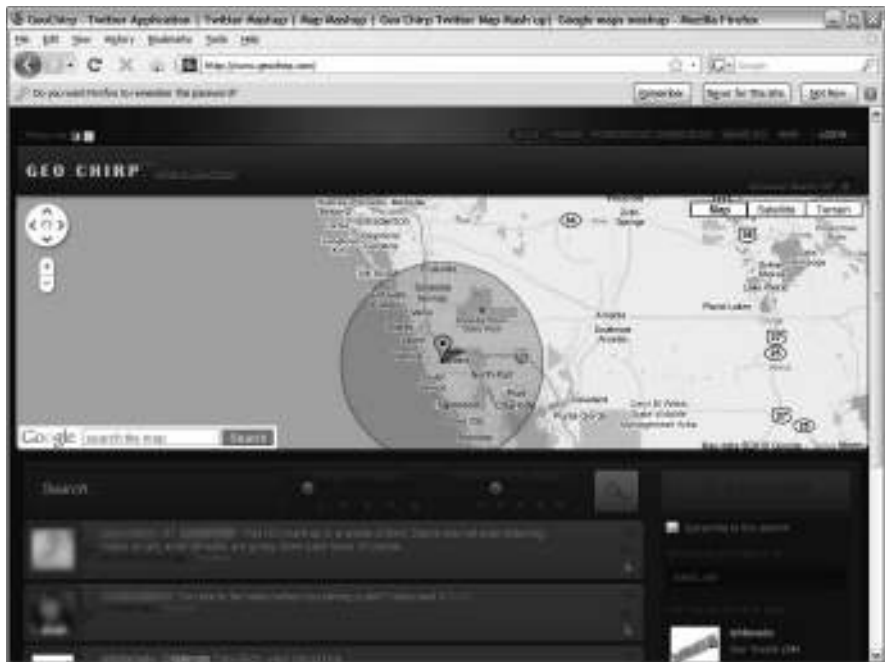
Figure 3-5: Follow conversations near where you live.