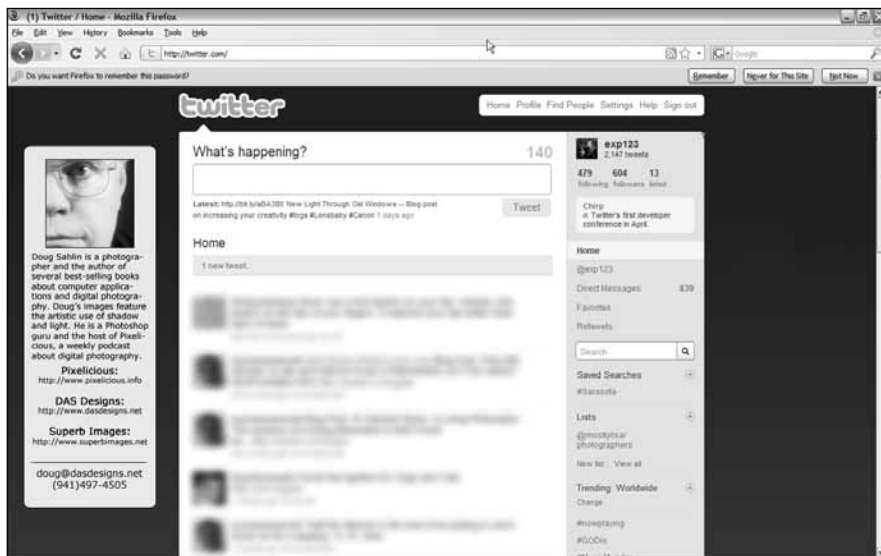
Figure 3-2: A custom background displayed on a Twitter page.

Your cool new background appears on your Twitter page. Figure 3-2 shows a custom background. The document was optimized for a desktop that is 1280 pixels wide.