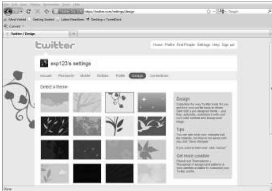
Figure 3-1: Adding a custom background to your Twitter page.