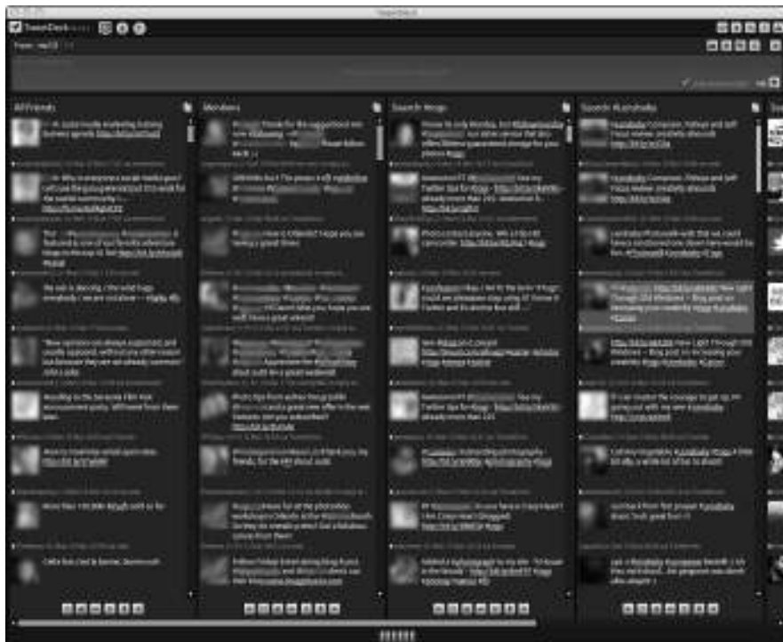
Figure 3-3: Keep track of your followers with TweetDeck.

You have a solution for this dilemma. The powerful desktop application TweetDeck, at www.tweetdeck.com , updates in real time, as shown in Figure 3-3. When someone sends a tweet, it appears in TweetDeck almost instantaneously along with an alert.