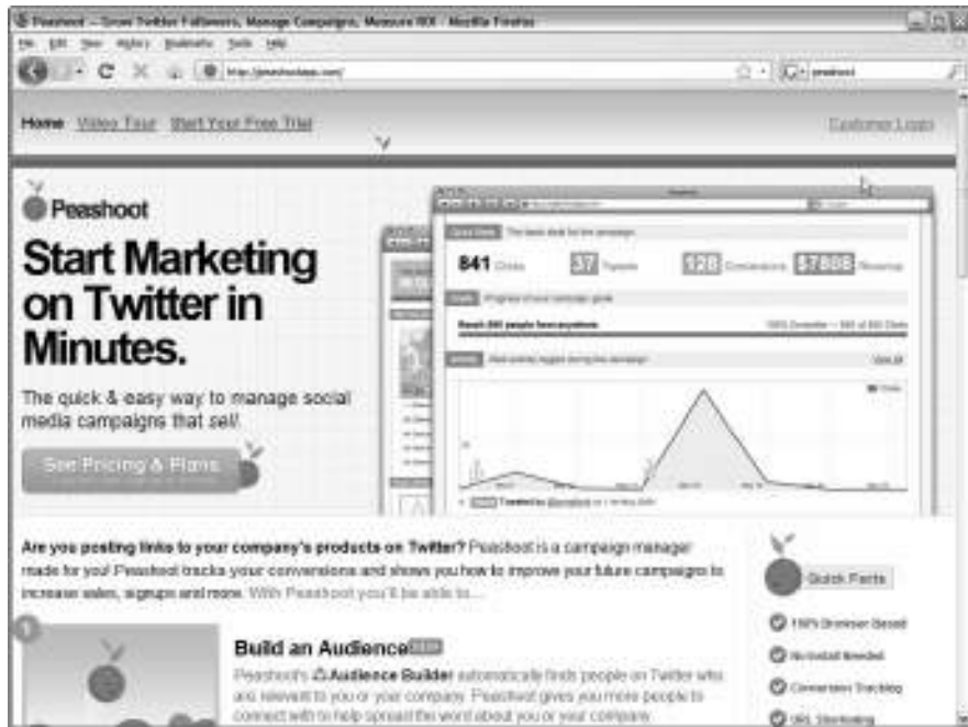
Figure 3-7: It's Peashoot, not crapshoot.