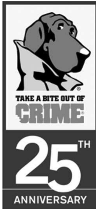
FIGURE 6.14 McGruff the Crime Dog® helping Americans “Take A Bite Out of Crime”® 23

National Crime Prevention Council, a private nonprofit organization, serves as the day-to-day manager of the campaign, which is funded through a variety of government agencies as well as corporate and private foundations and donations from private individuals. It is one of the most successful public service campaigns in history, with a recent identity theft initiative funded by the Department of Justice to help consumers take practical steps to protect their personal information.