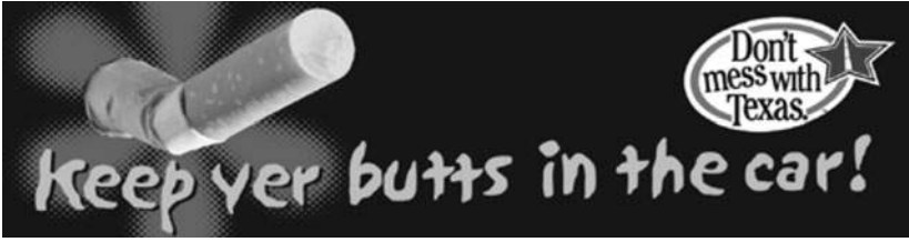
FIGURE 6.12 Don't Mess with Texas bumper sticker offered free to residents