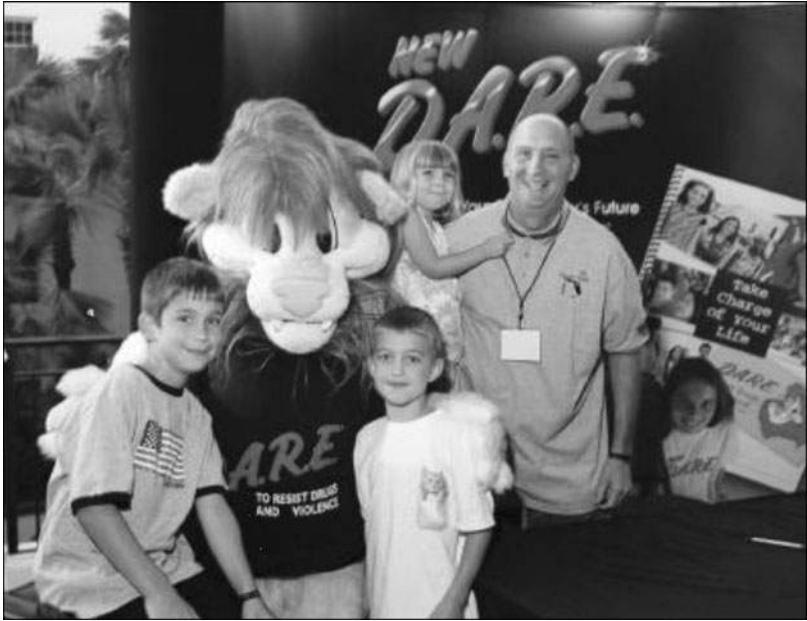
FIGURE 6.15 Promoting the revitalized D.A.R.E. program 27

Your Mind. One of the inspirational stories they share is of their involvement in helping to position the island of Jamaica as a premier destination for tourists.