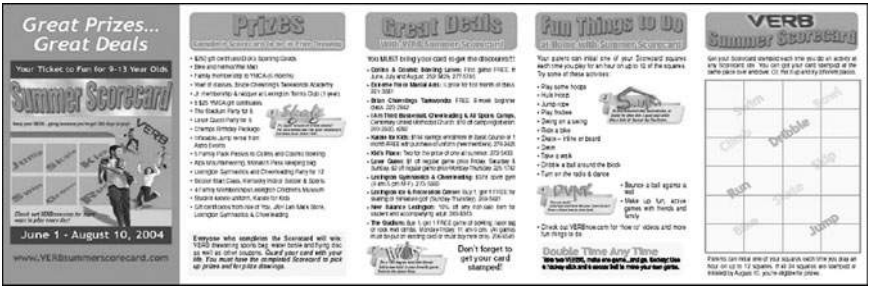
FIGURE 6.7 Campaign material used in Lexington, Kentucky highlighting the brand promise