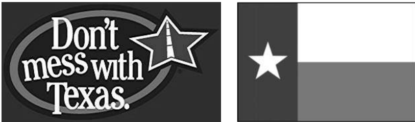
FIGURE 6.11 Litter prevention slogan on the left and the Texas State flag on the right

Clearly some of the success in achieving 95 percent name recognition among Texans is due to the selection of campaign elements that reflect this spirit, starting with the selection of the campaign's name. 16 Colors in the campaign logo match those of the state flag (red, white, and blue), and the use of the star symbol with a highway graphic connects it to the flag as well (see Figure 6.11).