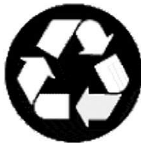
FIGURE 6.9 Recycling symbol

Meaningful —Ideally, the brand element suggests something informative and relevant to the target audience, something that helps them decide whether to “participate.” Consider the inherent and rich meaning in names such as “Neighborhood Watch” and “Parents: The Anti-Drug.”