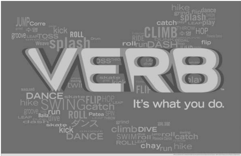
FIGURE 6.8 Tweens are encouraged to “pick their verb”

positioning. Kotler and Keller have identified six major factors to guide these selections, ones that can be used to evaluate a pool of options, testing them with target audiences relative to these ideals: 14