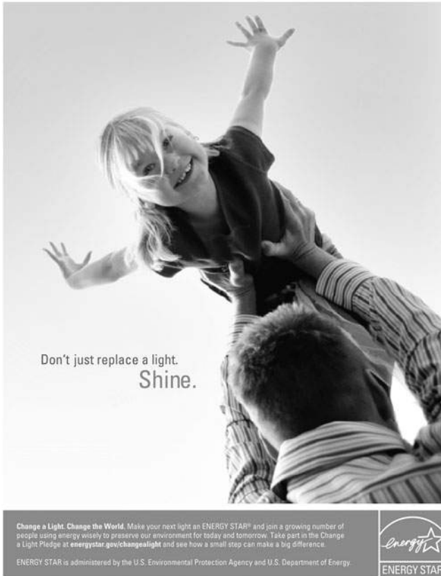
FIGURE 6.2 A campaign pairing up the U.S. Environmental Protection Agency with the Department of Energy