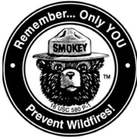
FIGURE 6.5 Image and slogan used in 2005

By 1952, the Smokey Bear symbol began to attract commercial interest, enough so that legislation was passed to take Smokey out of public domain and place him under the control of the Secretary of Agriculture. An amendment in 1973 offered commercial licensing and directed that fees and royalties were to be used to promote forest fire prevention. Hundreds of items have been licensed under this authority over the years, several featured in Smokey's "Museum" on his official Web site SmokeyBear.com .