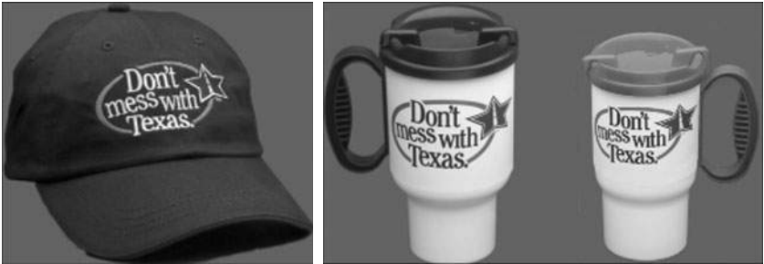
FIGURE 6.13 A portion of Don't Mess with Texas merchandise sales help fund the "Don't Mess with Texas" litter prevention campaign

Most importantly, the brand supports the state's objectives to reduce littering. In less than ten years following the launch of the campaign, litter on Texas roadways was reduced by 52 percent. Perhaps the fact that in 2005 the Texas Department of Transportation began cracking down on unauthorized use of the slogan and logo is one additional indicator of the brand's evolution.