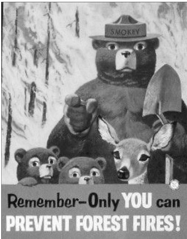
FIGURE 6.4 Poster used in 1948

The guardian of forests in the U.S., and one of the world's most recognizable fictional characters, has been a part of the American scene for more than sixty years. Smokey Bear, dressed in a ranger's hat and belted blue jeans and carrying a shovel, has been the recognized wildfire prevention symbol since 1944 (see Figure 6.4). The slogan "Only YOU Can Prevent Forest Fires" was first used in 1947 and was only changed slightly in 2001 when his message was updated to "Only YOU Can Prevent Wildfires" to address the increasing number of wildfires in the nation's wildlands (see Figure 6.5).