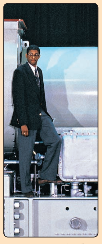
Project Manager handles all aspects of the order, maintains liaison with the Customer, controls documentation, arranges quality audits, and is responsible for on-time shipment and scheduling equipment commissioning at the Customer site.