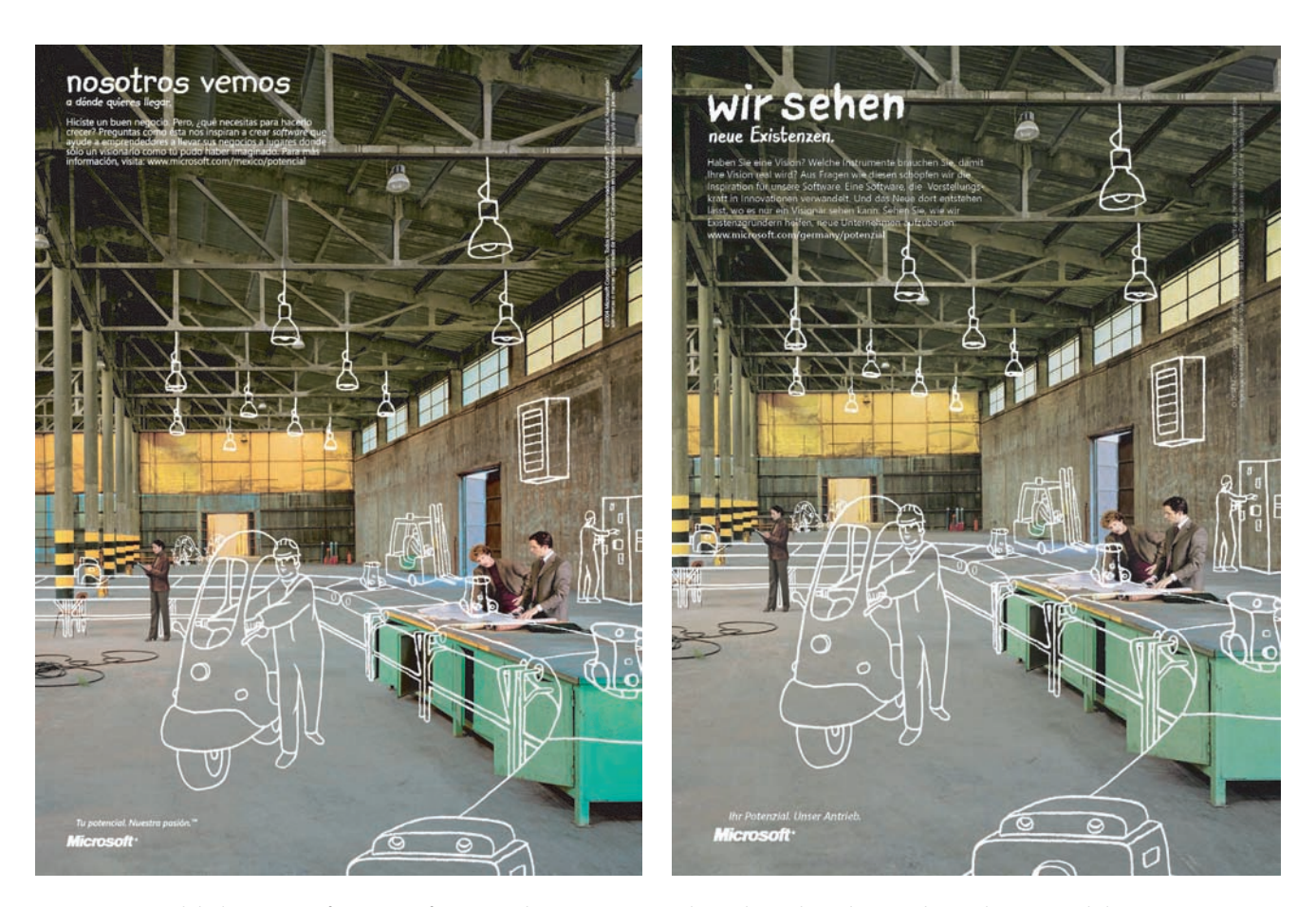
A more recent global campaign for Microsoft B2B products mentions nothing about the IT bust and uses the universal slogan "Your potential. Our passion" for both the Mexican and German markets, as in the United States.

industrial markets have an additional crucial reason for venturing abroad: dampening the natural volatility of industrial markets. Indeed, perhaps the single most important difference between consumer and industrial marketing is the huge, cyclical swings in demand inherent in the latter. It is true that demand for consumer durables such as cars, furniture, or home computers can be quite volatile. In industrial markets, however, two other factors come into play that exacerbate both the ups and downs in demand: Professional buyers tend to act in concert, and derived demand accelerates changes in markets.<sup>3</sup>