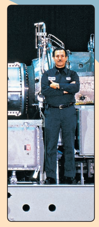
Manufacturing Technicians produce, assemble, and test industrial gas turbines and turbomachinery packages designed to meet specific Customer needs. Manufacturing also arranges shipment of equipment to the Customer site where ...