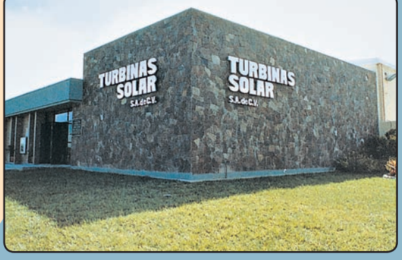
Solar has a variety of sales and manufacturing operations and affiliations in Mexico, including a maquiladora plant in Tijuana, offices in Mexico City, and a technology-sharing agreement with Turbinas Solar. The last facility is located in Veracruz and is pictured above.

Solar has also signed long-term alliance agreements with some of its major customers like Shell Oil. Pictured here are the Solar and Shell executives who worked on the agreement and then signed it at Solar's San Diego headquarters.