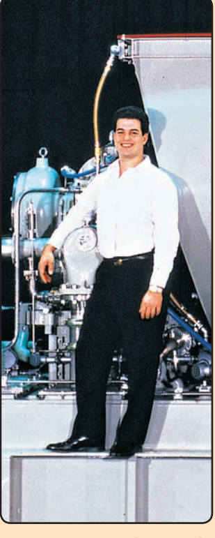
Engineering and Control Systems, where gas turbines, gas compressors, and controls are designed and gas turbine packages are customized for the customers based on proven designs.