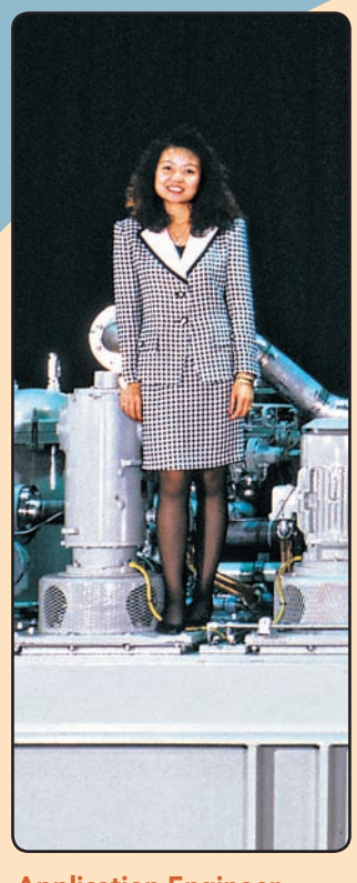
Application Engineer, who is responsible for determining the best product match for Customer requirements and recommending alternative approaches as appropriate. The Application Engineer works closely with ...